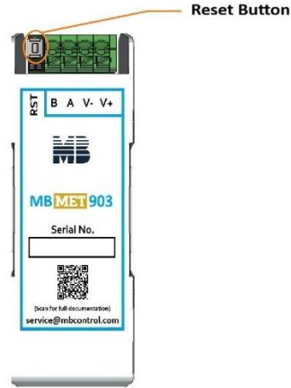
Fig- 7: Position of Reset Button

Step-1 Locate the Reset Button on the sensor, as shown in Fig- 7.