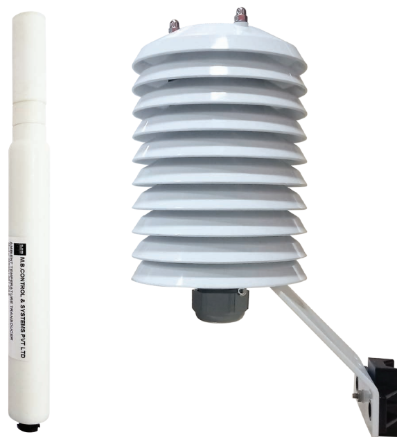
MBMet 901 series with Radiation Shield