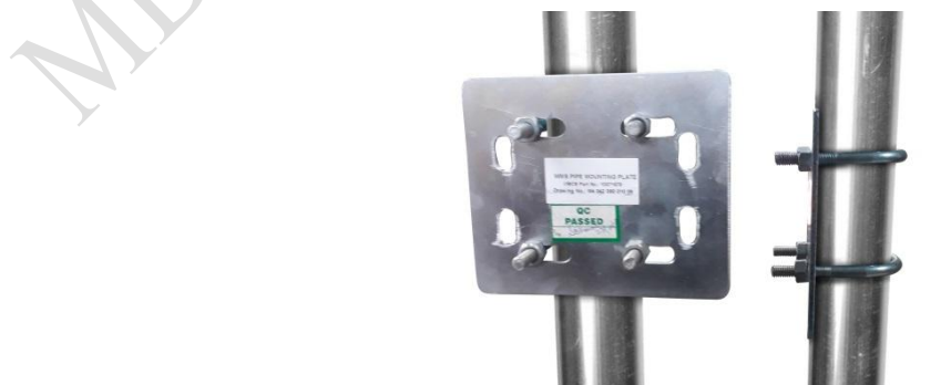
Fig 2.1 – Adapter plate mounted on 50.8mm vertical Pole

Install the adapter plate shown in Fig 2.1 to 50.8mm pole with the help of the 50.8mm U-Clamp set. Use the Hole marked A in the Fig 1.1, item no 6. Follow the picture for mounting the plate as in Fig 2.1. Adapter plate should be installed on 50.8mm pole at height where wind speed has to be measured