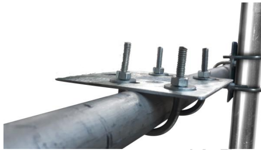
Fig: 2.3 – Wind Speed Sensor mounted on horizontal pipe

Install the Wind Speed pipe mounting using TWO 31.75mm U-clamp sets.