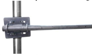
Fig 2.2–Pole Mounting Pipe mounted horizontal to ground

Install the pipe as shown in Fig 2.2 with the help of two 31.75mm U-Clamp sets to the Adapter Plate. Use the Hole marked B in the Fig 1.1, item no 6. Follow the picture for mounting the plate as in Fig 2.2.