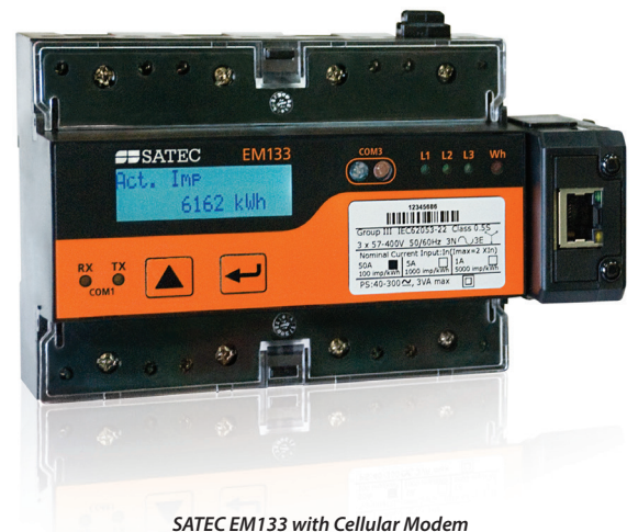
SATEC EM133 with Cellular Modem

Reports on light operation and energy consumption will be sent to eXpertpower server via cellular modem.