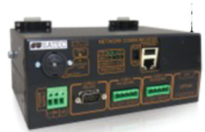
SATEC DCU ETC-II with Cellular Modem

User will be able to log-in to eXpertpower cloud service using user name and password assigned to him and view all the parameters and reports.